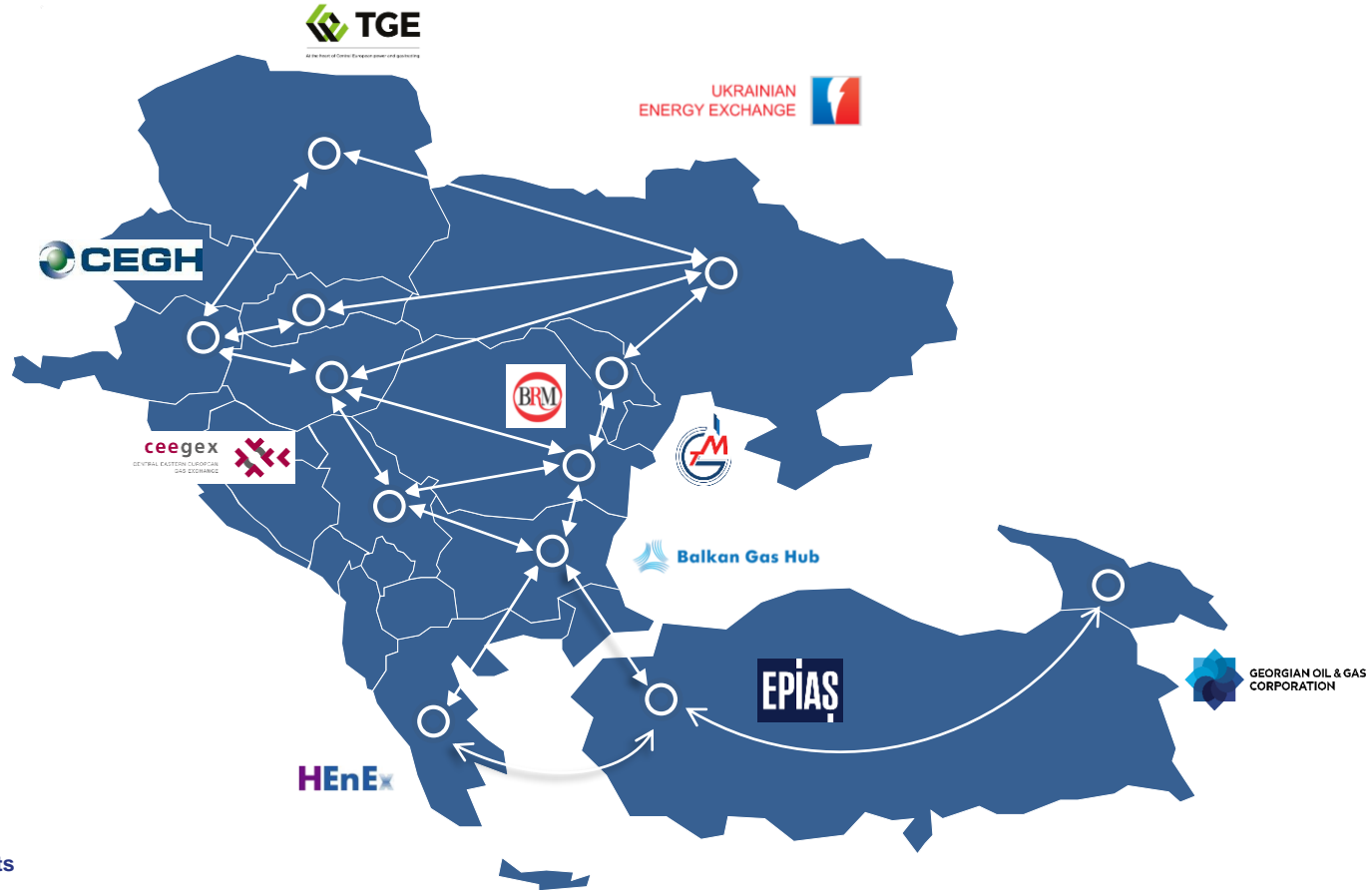
⦿ Hubs and Virtual Trading Points