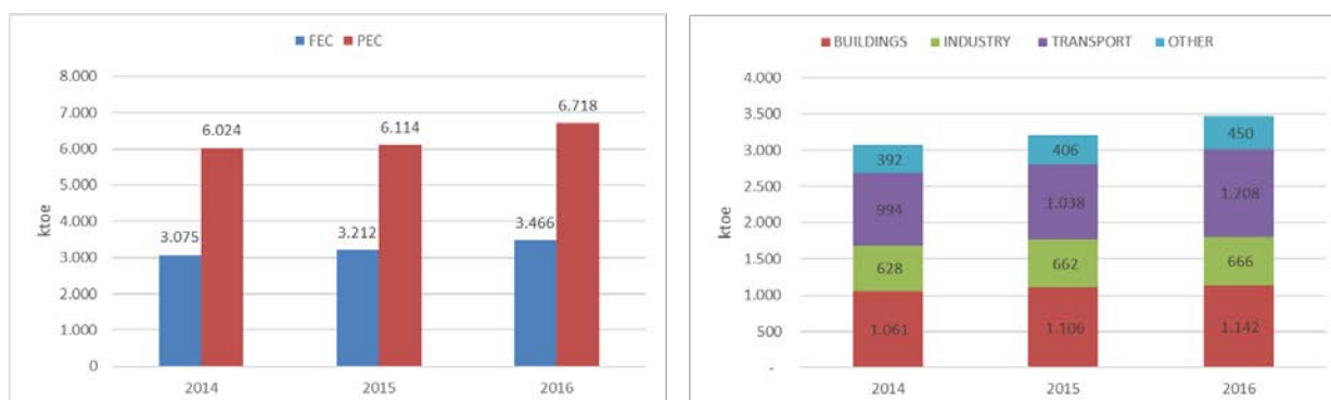
Figure 1: Final and primary energy consumption (left) and final energy consumption per sectors (right) in 2014 – 2016 .

The trends in energy consumption for B&H are here given for years 2014-2016. In that sense, the energy balances provided by BHAS in 2014 - 2016 are used.