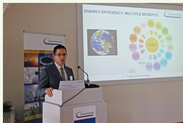
First Civil Society Day, Vienna, 21 June 2016