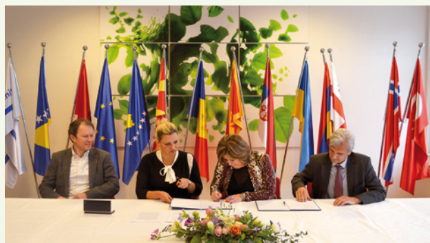
Serbian representatives sign Western Balkan 6 Memorandum of Understandings, Vienna, 27 April 2016

implementation projects, and details of important technical solutions.