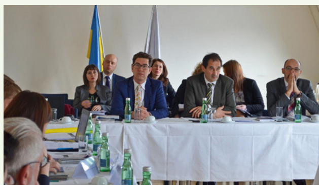
Hearing on draft unbundling plan of Naftogaz, Vienna, 14 March 2016

Following the transposition of the Third Energy Package in Serbia and Albania and in the gas sector in Ukraine, three additional Contracting Parties - Moldova, Montenegro and Kosovo* - followed suit during this reporting period. The focus of these countries has now shifted to implementation via the adoption of secondary legislation. The Secretariat has continued to assist the Contracting Parties in the implementation stage. In several instances, this has meant stepping on untested ground as the Secretariat made use of its new competences under the Third Energy Package for the first time.