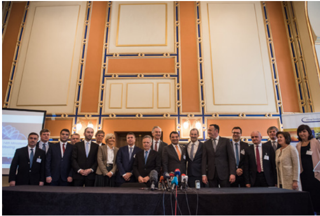
Ministerial Council, 14 October 2016, Sarajevo