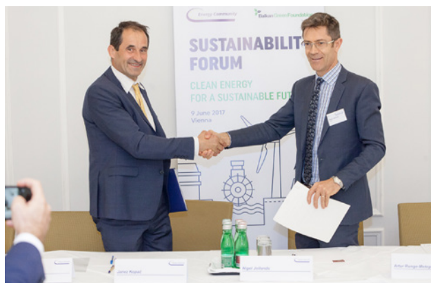
Signing of the Memorandum of Understanding between EBRD and Secretariat, 9 June 2017, Vienna

The European Bank for Reconstruction and Development (EBRD) and the Energy Community Secretariat signed a Memorandum of Understanding strengthening the organisations' cooperation in the field of sustainable development with a focus on sustainable energy policy in the Western Balkans, Moldova, Ukraine and Georgia. The two organisations agreed to work together to contribute to an enabling environment for sustainable investment and a smooth transition towards sustainable, low-carbon economies in Southeast Europe and the Black Sea region. The agreement, signed on 9 June 2017 in Vienna, brought new opportunities for cooperation on sustainability issues, including climate change.