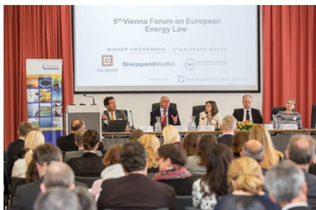
Vienna Forum on European Energy Law, 5 May 2017, Vienna

This reporting period the Secretariat hosted a record 70 official events with almost 3.000 participants, not taking into account ad-hoc workshops and working group meetings.