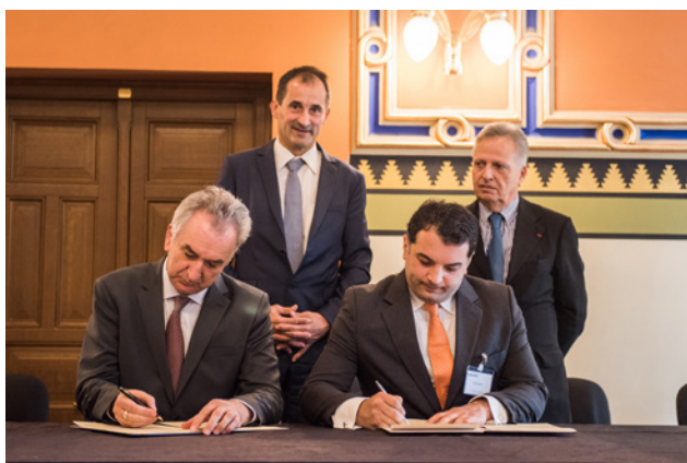
Signing of Accession Protocol, 14 October 2016, Sarajevo

those of the Energy Community Contracting Parties. Georgia's accession also marks another milestone in the development of the Energy Community.