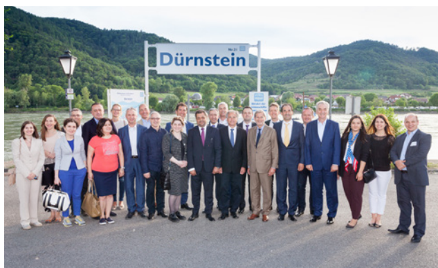
Informal Ministerial Council, 9 June 2017, Dürnstein

Energy Performance of Buildings Directive was achieved by all Western Balkan six countries. On next-generation support measures for renewable energy deployment, Albania was the first Energy Community Contracting Party to have adopted a law that introduces a competition-oriented auction procedure for the allocation of future renewable energy capacities. Community energy projects and energy cooperatives for the production of renewables continue to grow.