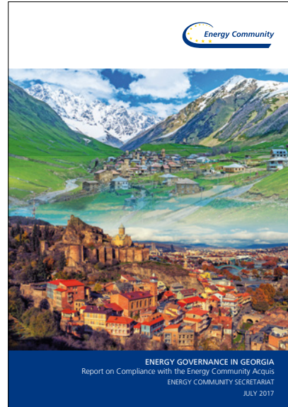
Report on Energy Governance in Georgia

This year saw the publication of the first comprehensive report assessing Georgia's compliance with the acquis communautaire . The Energy Community Secretariat also published policy recommendations aimed at assisting Armenia, an Observer to the Energy Community Treaty, to design and implement effective reform measures in its energy sectors.