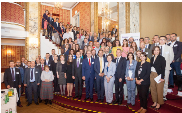
Sustainability Forum, 9 June 2017, Vienna

With respect to climate action, Albania, Serbia and Montenegro are advancing in the drafting of climate change laws and all Western Balkan six countries are generally fulfilling their reporting obligations to the UNFCCC. As regards measures to improve governance for energy efficiency, progress in transposing the