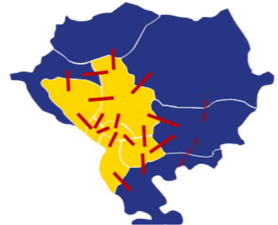
II. ITME CCR