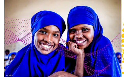
Education and research