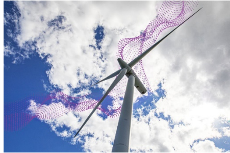
Climate and energy