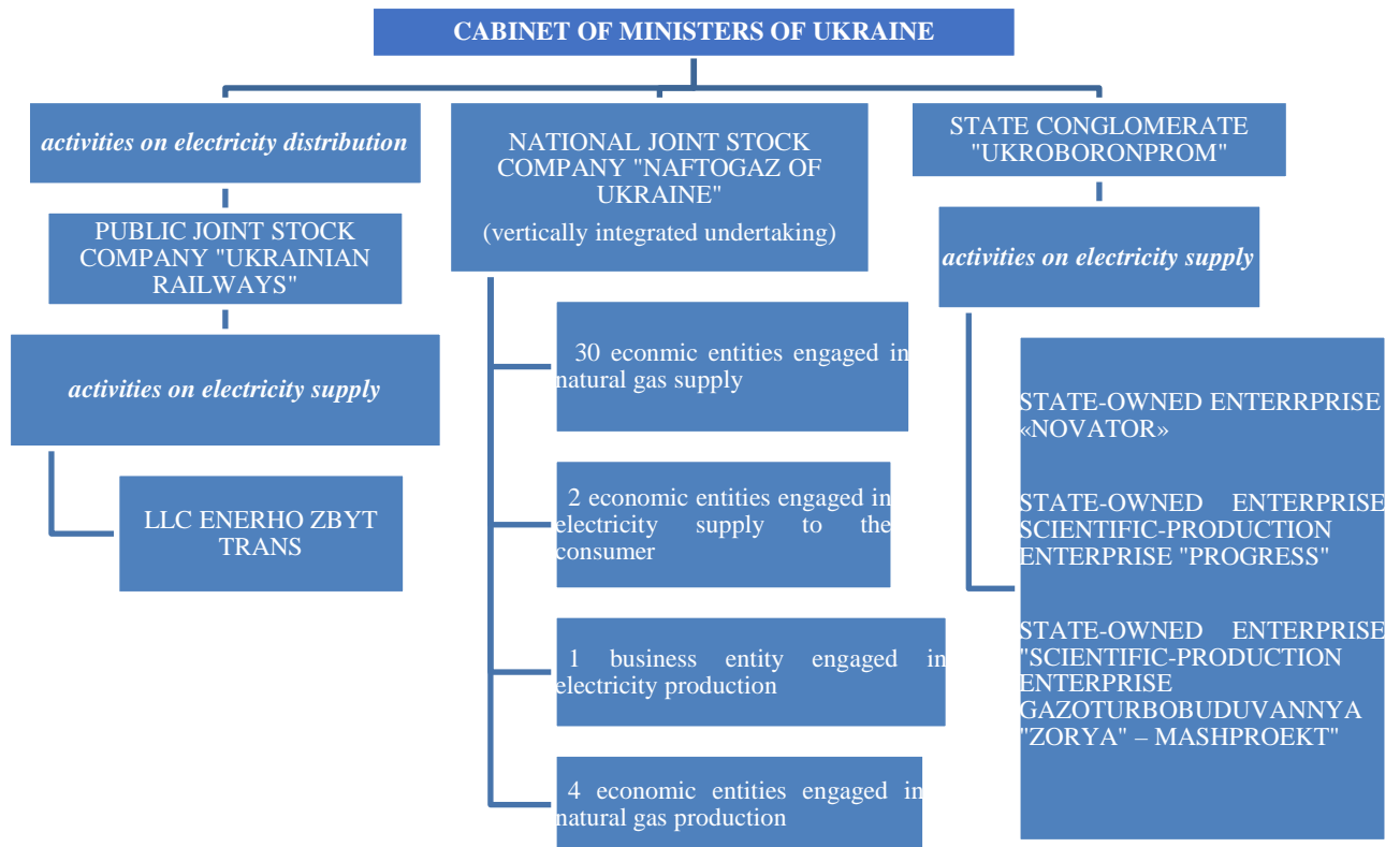
Fig. 1. Economic entities in the energy sector that fall under the management of the Cabinet of Ministers of Ukraine (as of the date of the request for certification)

At the same time, National Joint Stock Company "Naftogaz of Ukraine" as the main (parent) company remains under full state ownership (100%), and the Cabinet of Ministers of Ukraine 1 acts as an organization authorized to manage corporate rights of the state (organization-owner). Before the start of corporate governance reform of the company, which started in 2015, the shareholders rights in National Joint Stock Company "Naftogaz of Ukraine" were exercised by the Ministry of Fuel and Energy of Ukraine, and then in December 2015 these rights were transferred to the Ministry for Economic Development and Trade (MEDT).