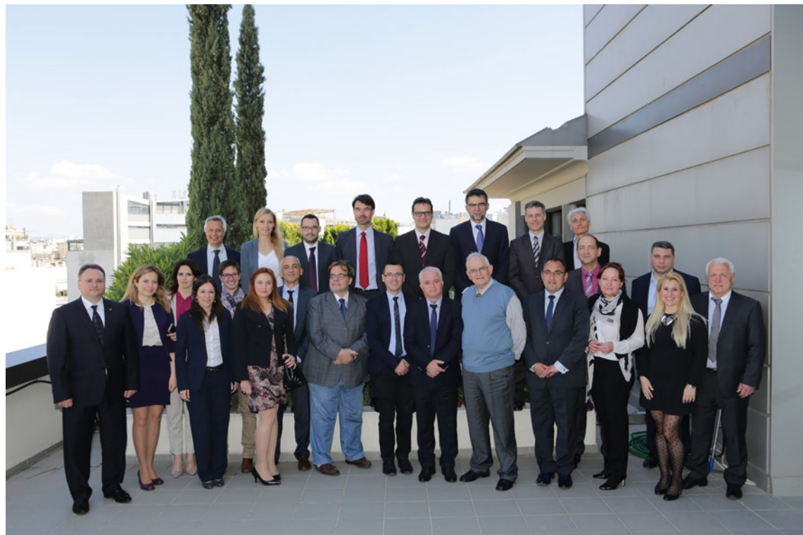
ECRB Board, 19 April 2017, Athens, Greece

Details on ECRB Working Groups, Task Forces, work programmes and deliverables are available at www.energy-community.org/aboutus/institutions/ECRB.html .