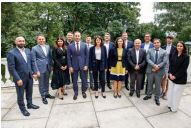
Informal Ministerial Council, 8 July 2022, Baden, Austria

At the Informal Energy Community Ministerial Council on 8 July 2022 in Baden, Austria, Ministers concluded negotiations on the level of 2030 targets for energy efficiency, renewables and greenhouse gas emission under the presidency-in-office of Ukraine. The Contracting Parties reached a high level of ambition on targets for energy efficiency, putting a cap on the amount of final and primary energy consumption, boosting renewables and reducing greenhouse gas emissions by 2030, in line with the commitment to achieve climate neutrality of their economies by 2050. The targets are expected to be formally adopted at the Energy Community Ministerial Council in December 2022.