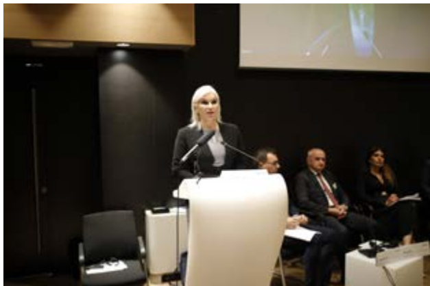
Energy Community Just Transition Forum, 12 July 2022, Sarajevo, Bosnia and Herzegovina