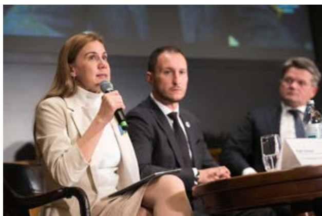
High Level Event on the Security and Stability of the Ukrainian Energy Sector during the War and its Post-War Revitalisation, 10 April 2022, Vienna, Austria

EU4Energy has identified the specific activities that will be implemented until the end of 2022 in Georgia, Moldova and Ukraine.